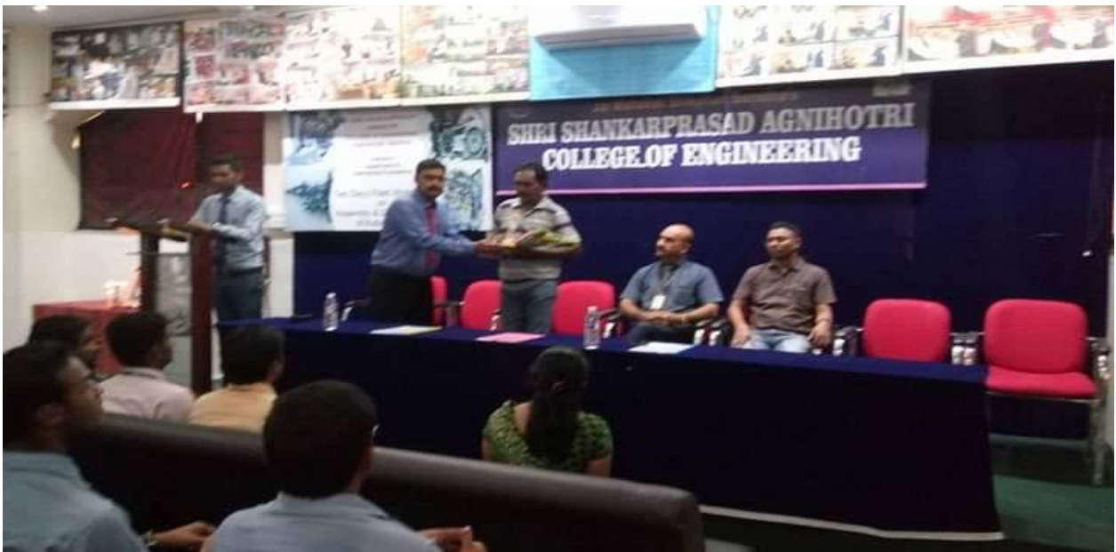
Event 45. Photos of One day workshop on Differential Gear Box